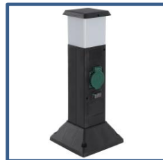
Image de l'article. Sample picture of the item.

L'objet décrit est conforme à la législation d'harmonisation de l'Union pertinente: The described object of the declaration is in conformity with the relevant Union harmonisation legislation: